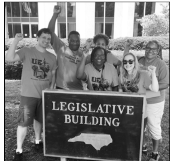
UE150 members from UNC, Cherry Hospital, Butner, and City of Durham, May 2018